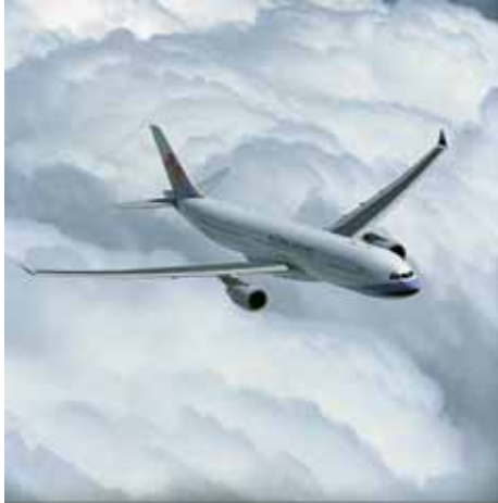
Archive photos. Indicative description non contractual.

Passengers cabin dimensions Exterior dimensions length : 147 ft 8 in length : 193 ft 7 in height : 57 ft 1 in width : 17 ft 4 in wingspan : 197 ft 10 in