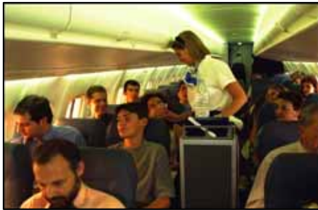
Archive photos. Indicative description non contractual.